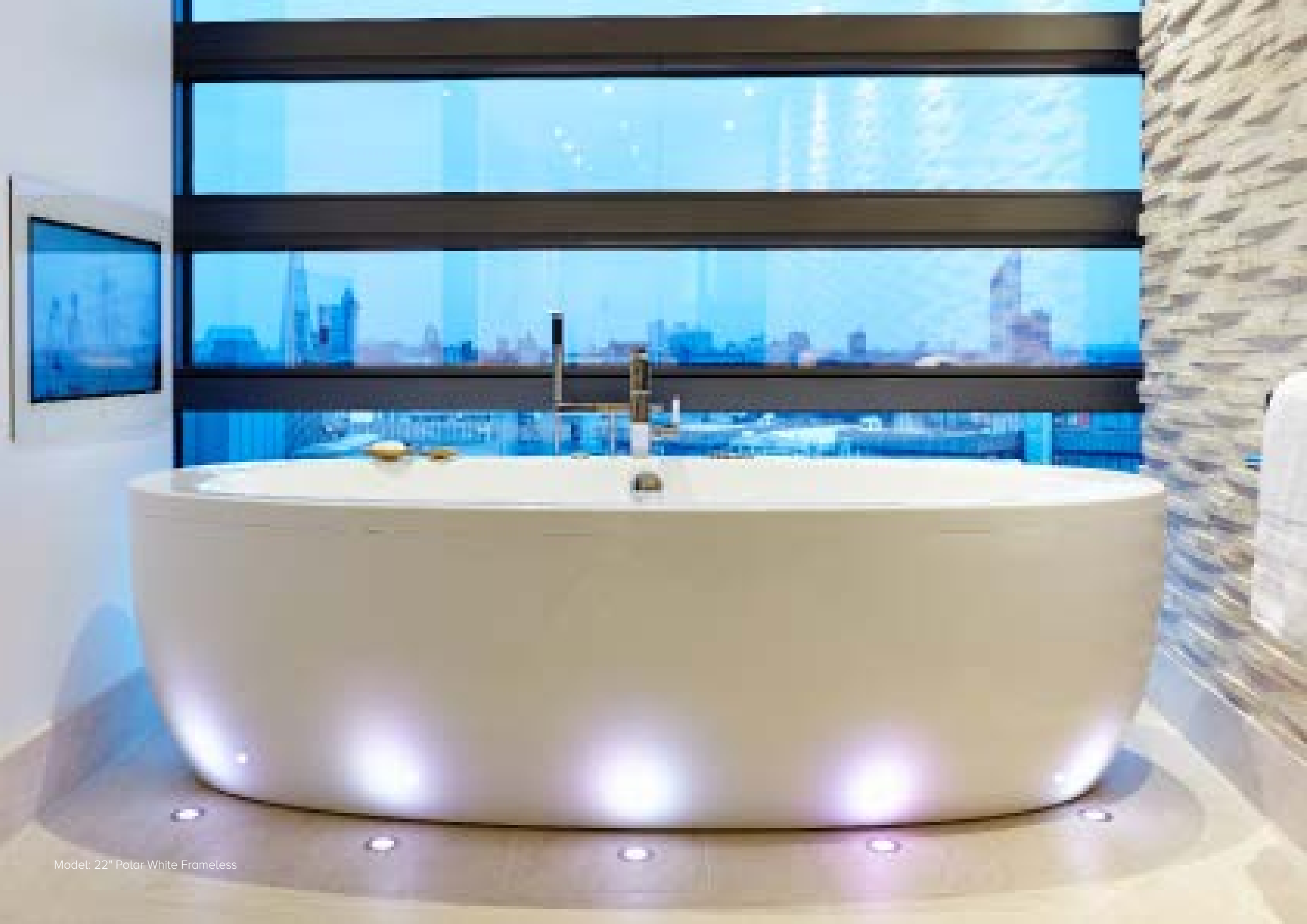
Model: 22" Polar White Frameless