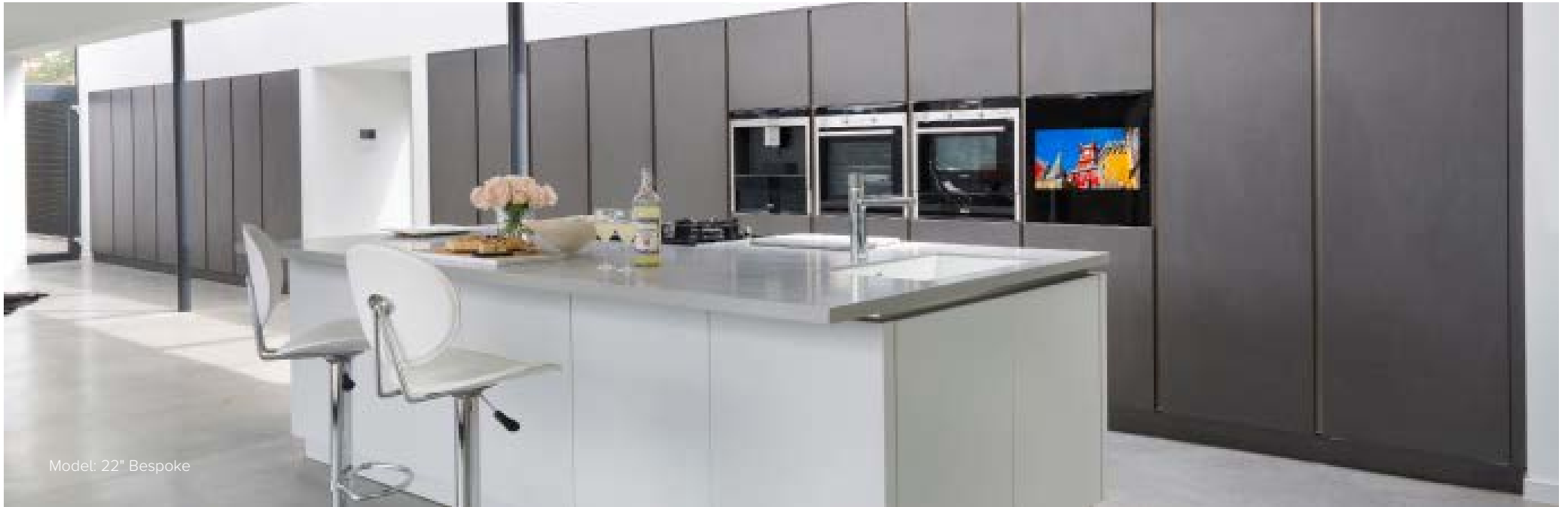
Model: 22" Bespoke