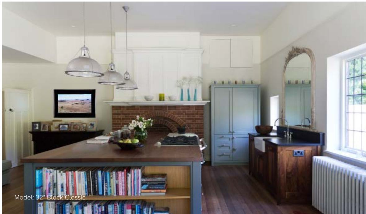
Model: 32" Black Classic