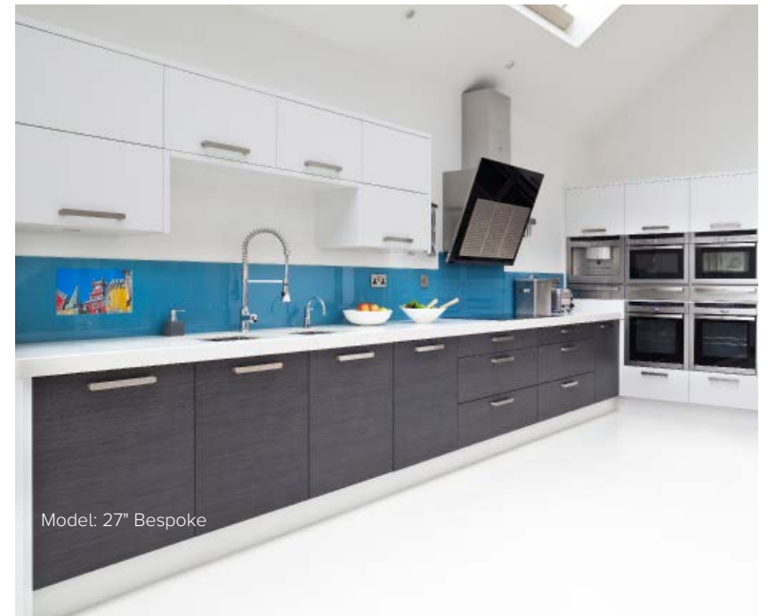
Model: 27" Bespoke