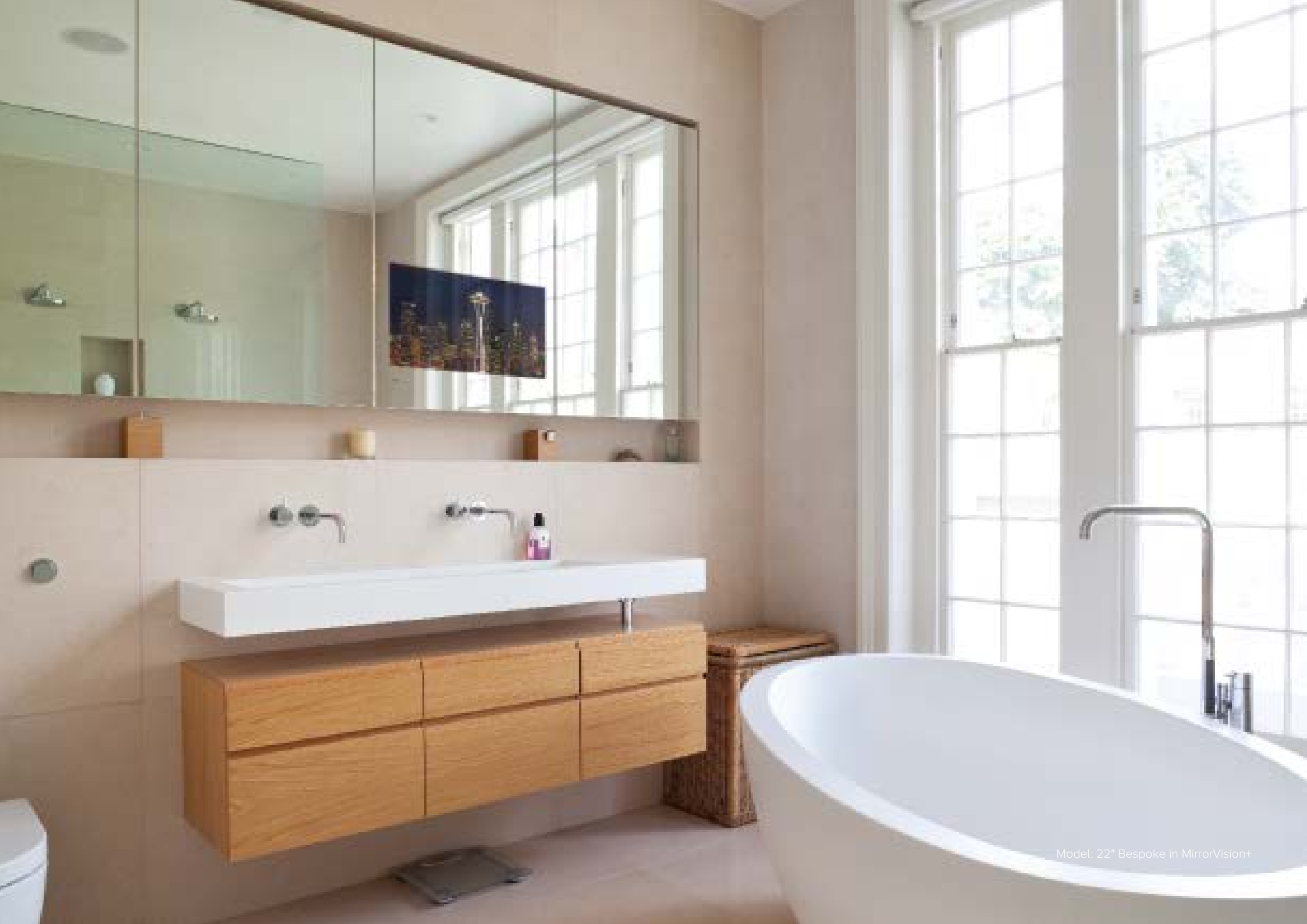
Model: 22" Bespoke in MirrorVision+